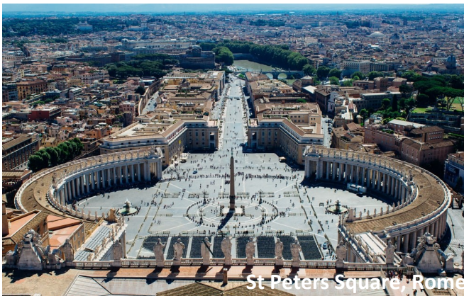
St Peter's Square, Rome

Friday: Meet and greet by your private driver on arrival in Rome and transfer to the Hotel Conciliazone in the heart of Rome. Late afternoon meet with your Tour Host in the hotel. You will learn about your tour and get to know your companions. Walk to a local restaurant for a welcome dinner