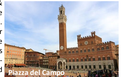
Piazza del Campo

Monday: Motor coach through the Tuscany Hills to Siena, passing small enchanting villages as well as vineyards and castles in the region. Siena was the only city that competed against Florence for power, wealth and artistic beauties. Enjoy a wine & food experience in the heart of the old town. After lunch discover Piazza del Campo, the main central square as well as exploring quieter backstreets and learning everything about the Contrade, the 17 medieval city districts that compete against each other in the Palio. Arrive at the Executive Hotel n Florence in late afternoon for 3 nights,